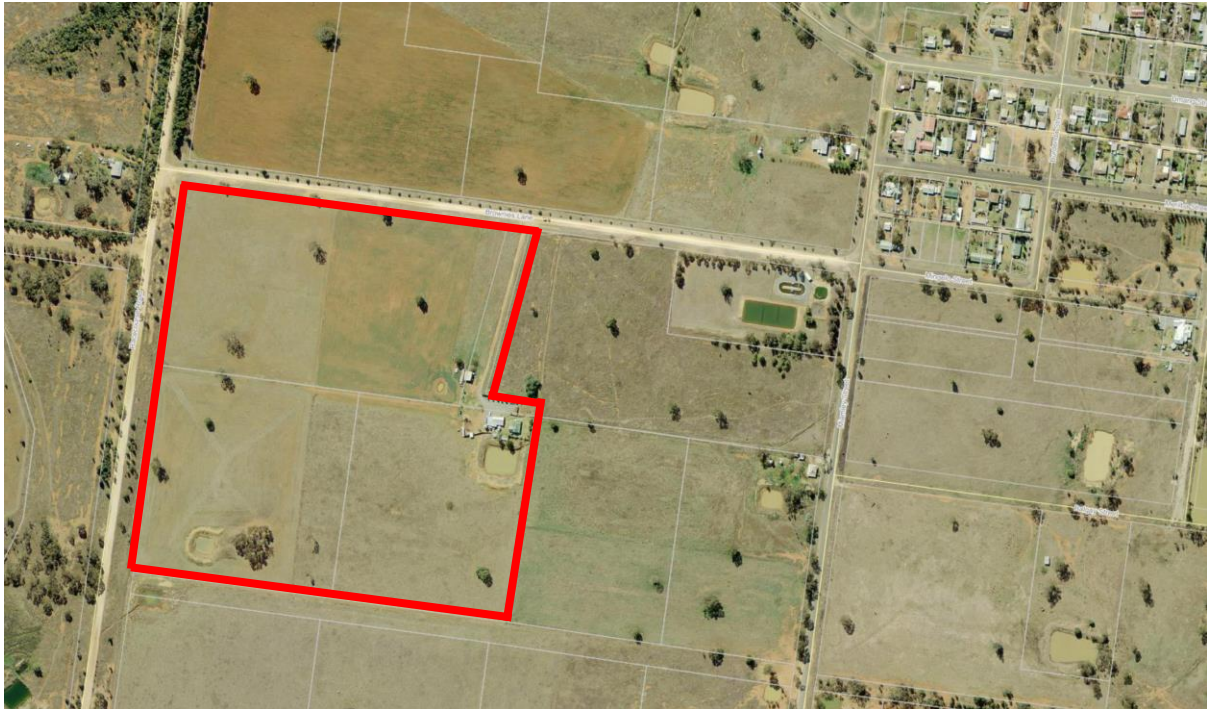
Figure 1 - Proposed site for Vehicle Repair Station

The preferred site for the Vehicle Repair Station (VRS) is identified in Figure 1 , below.