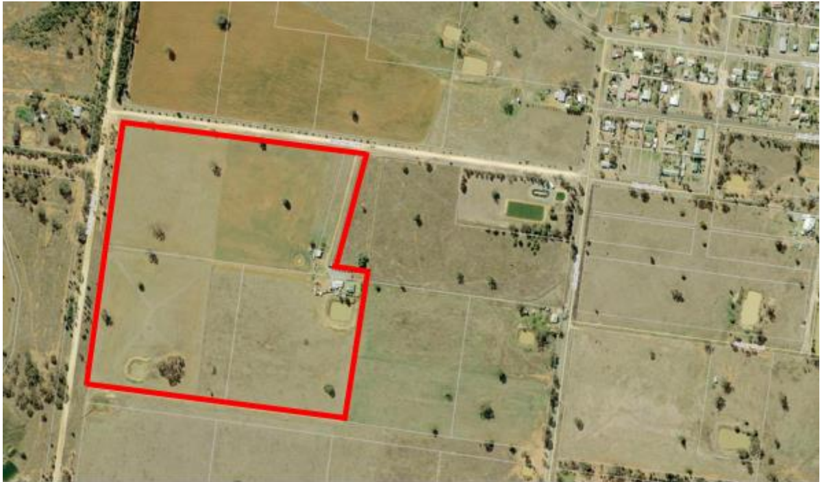
Figure 1 - Proposed site for Vehicle Repair Station